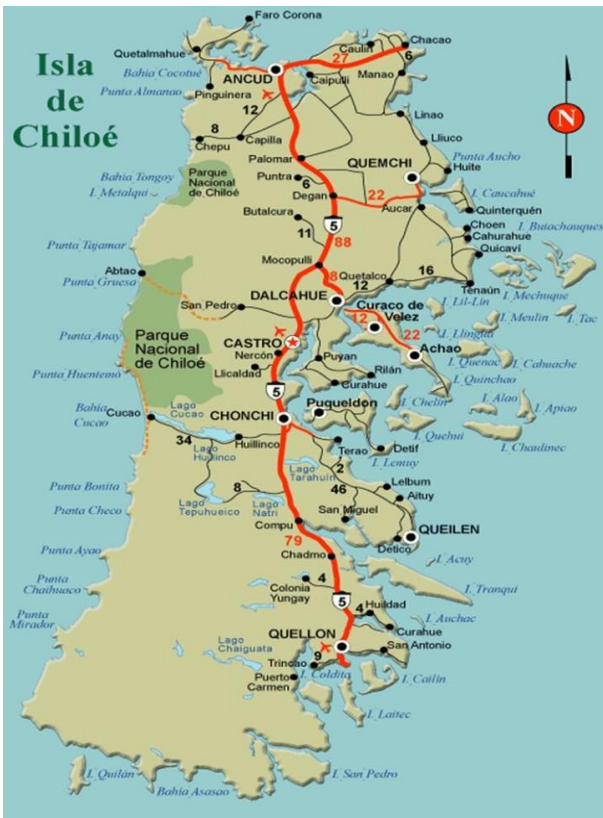
Chiloé Archipelago, southern Chile