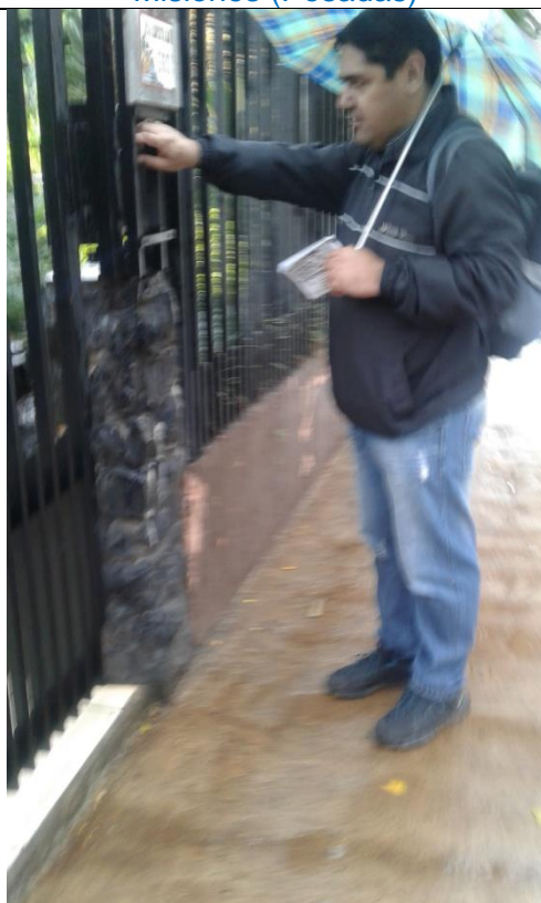
Ciudad del Este - Paraguay