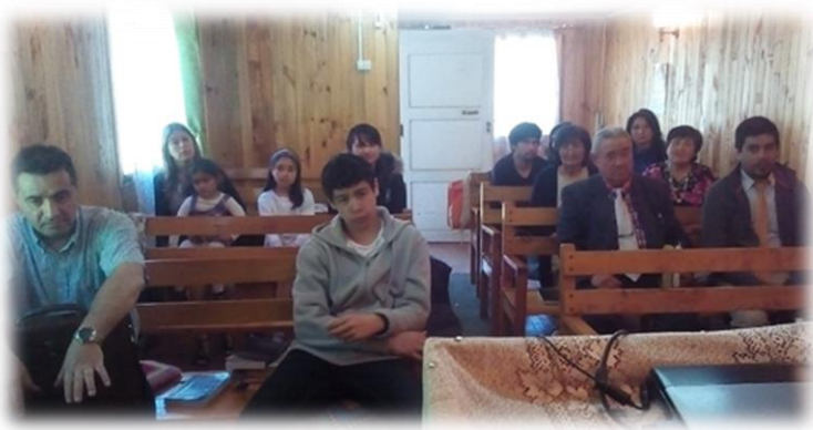
The brothers of the Church of Christ in Ancud, Chiloe Island, Chile.

My beloved brothers I am very grateful for the effort you make to support my gospel preaching work in Chile. Our kind God bless you. It is my longing and prayer that we can continue to work together for many more years, bringing the blessed word of the Lord throughout South America.