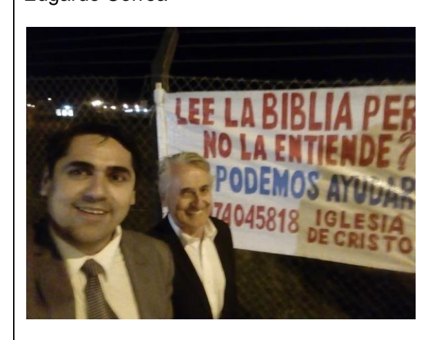
Poster placed in the Trevelin (Chubut) (2018)