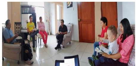
Teaching in the church of Christ in Trujillo, Perú.