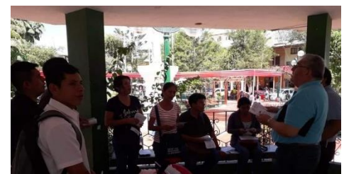
Singing in the park of Catacaos the song "I have decided to follow Christ".