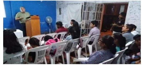
Teaching in the church of Christ in Catacaos.

The brothers of the church in Catacaos have invited me to visit them again soon and carry out this work for a week.