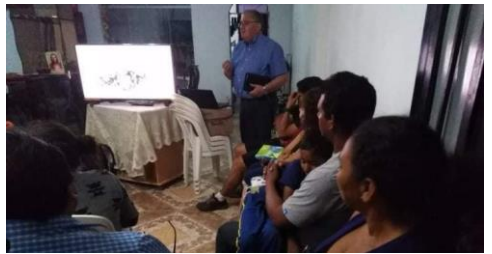
Teaching in the church of Christ in Chiclayo, Perú.