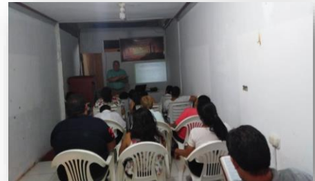
Teaching in the church of Christ in Tumbes, Peru.