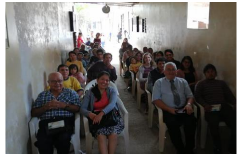
Teaching in the church of Christ in Puente Piedra, Lima - Perú.