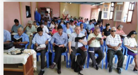
Teaching in the church of Christ in Paíta, Perú.