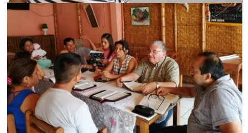
Teaching in the houses with the brothers of the church of Christ in Catacaos.