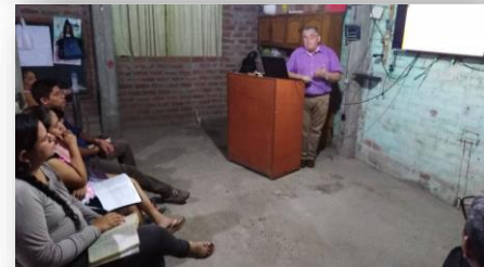
Teaching in the church of Christ in Sullana, Perú.