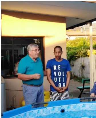
2.000 millas Limache a Punta Arenas

I keep videotaping Bible lessons every week to send to several brothers in Chile and other countries. These lessons are also on our YouTube channel. This effort has been a good tool in the work of strengthening the faith of the brothers and evangelizing the unsaved.