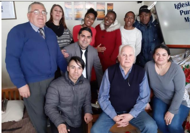
The first meeting of the church of Christ in Punta Arenas