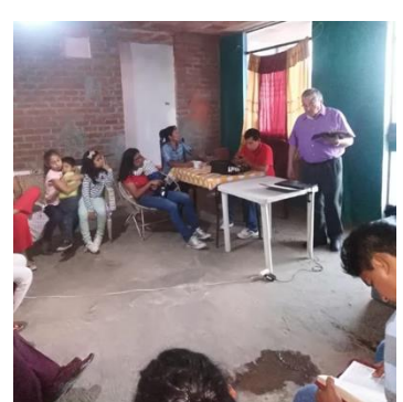
Working with the brothers in Catacaos, Peru. Teaching in the houses. Acts 20:20