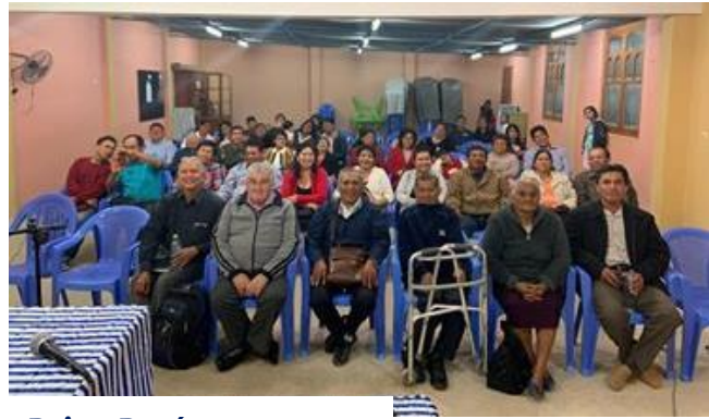
Working with the brothers in Paita, Perú.