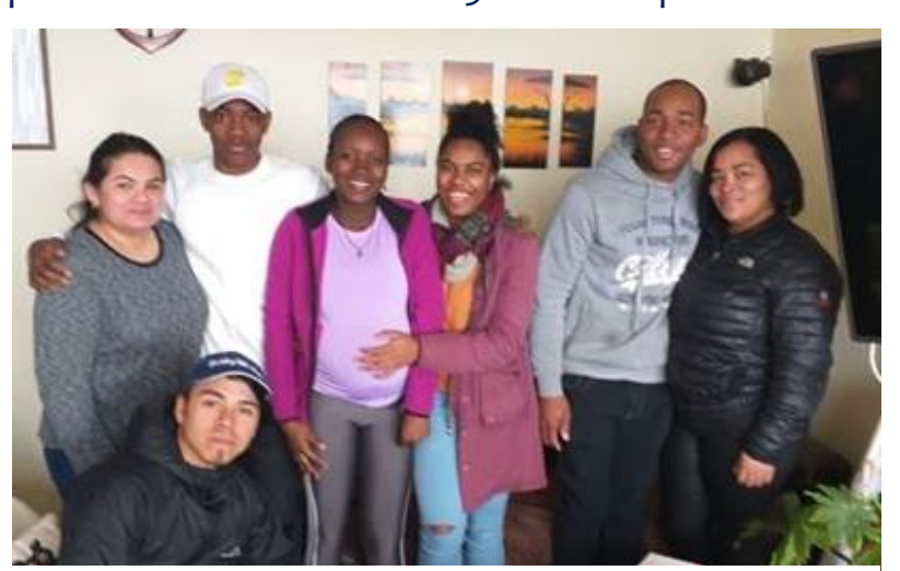
Brothers in Punta Arenas.

I am in contact with the brothers of the church of Christ in Punta Arenas, southern tip of Chile, a church that we established in September. I am supporting the brothers with Bible lessons and answering their questions and concerns, being very attentive to their spiritual needs. On October 5 he was baptized for the forgiveness of his sins (Acts 2:38)