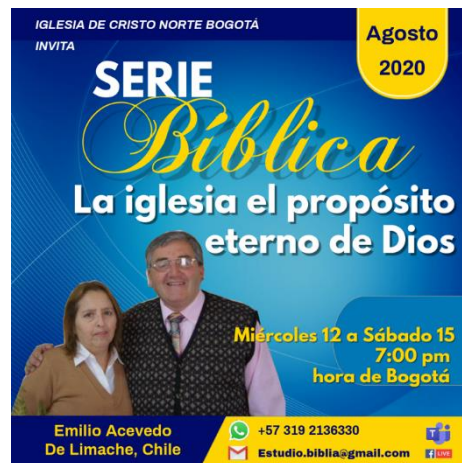
Some of the Bible study announcements.