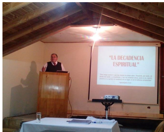
Preaching in churches Loncoche and Niebla - Valdivia Chile.