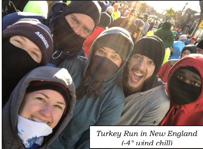
Turkey Run in New England (-4° wind chill)

and is now planning to work with us to find a better meeting location (we are currently meeting in the cafeteria) and also to help advertise the study throughout the hospital. We are excited about the possibility of having more people join us. Please pray for this study to provide more opportunities to open God's word with searching souls - and for me to be bold in proclaiming His truth.