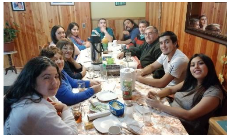
Brothers of the church of Christ in Villarrica, Chile.