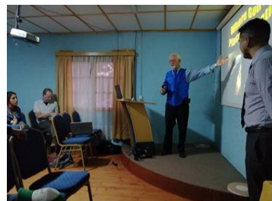
Brothers of the church of Christ in Limache.