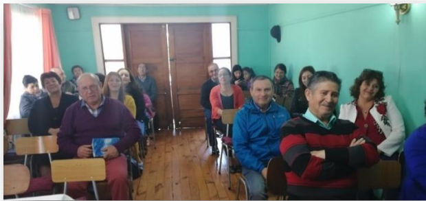
Iglesia de Cristo en Loncoche – Chile.