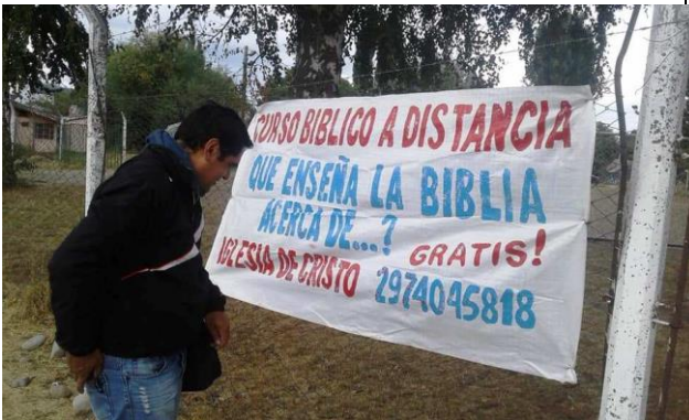
El Bolsón (Rio Negro – Argentina)