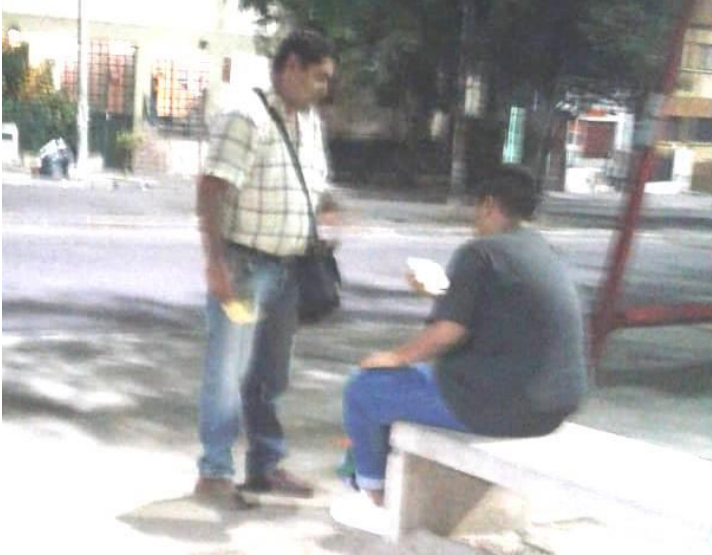
Evangelistic work in Jujuy (Argentina)