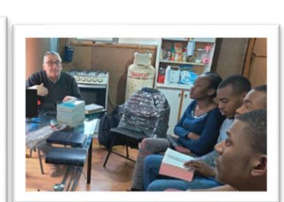
Meeting place and brothers in Punta Arenas - Chile.