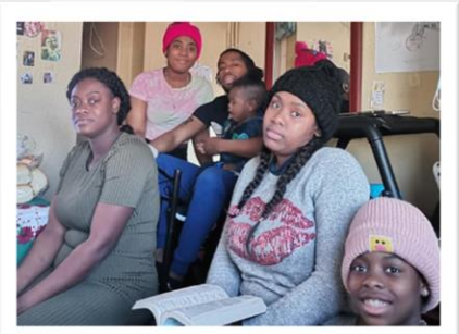
People who attended the Bible studies in the city of Porvenir.

My plans are, God permitting, to return to Punta Arenas with my wife and stay a month with the brothers to instruct them in sound doctrine and strengthen their faith. The brothers here show great interest in persevering in the faith, but they need instruction and companionship in their spiritual growth. I believe that being with these brothers for 4 weeks giving biblical teaching will be a great incentive for them in their spiritual life. Without a doubt, effort and dedication will be necessary, as well as obtaining the necessary financial resources to spend that time in the southern city of Punta Arenas. I trust that our God will provide the resources for this spiritual work.