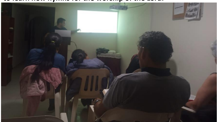
I continue to run the studios on Wednesdays.

In my Sunday responsibilities, I continue to lead the first hour study and sermons. At the end of each month, I lead a space to learn new hymns for the worship of the Lord.